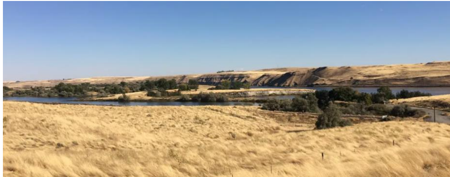
Present-day Big Flat Overlook, ancestral lands of the Lower Snake River Palouse, currently managed by the U.S. Army Corps.

Click here to find out more and to register.