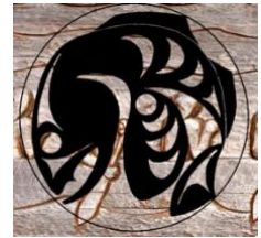
Samish 13 Moons Calendar: Moon of Little Bullheads (April)